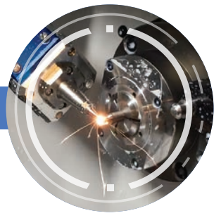
LASER CUTTING TECHNOLOGY